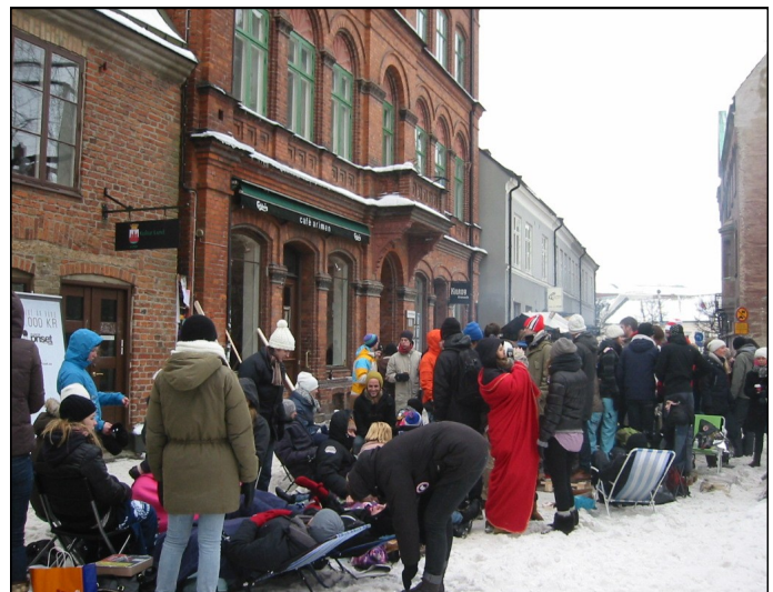
Waiting for hours to be a volunteer? That’s dedication!

Judging by the turnout, it is indeed an honour to hold the title of karnevalist (official participant and volunteer).