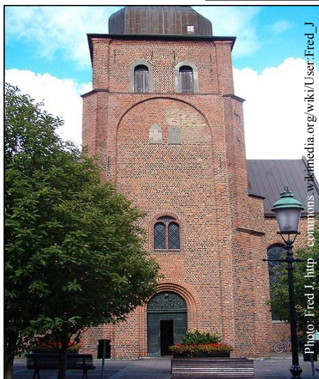
Ystad, a lovely little town less than an hour away from Lund

But it's not just fiction fans that will enjoy a trip to Ystad. This pleasant town facing the Baltic sea (there are ferries to Poland and the Danish island of Bornholm, it even has beaches not far